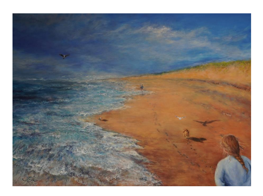
Dates For Your Diary in 2023!

Terese Eglington is an incredible local illustrator, author, artist, and educator, and for Term 1 and Term 2, she is hosting a 'how to illustrate' workshop just for 9 to 13 year olds. This is such a wonderful opportunity for aspiring artists. For more details and to book, click here.